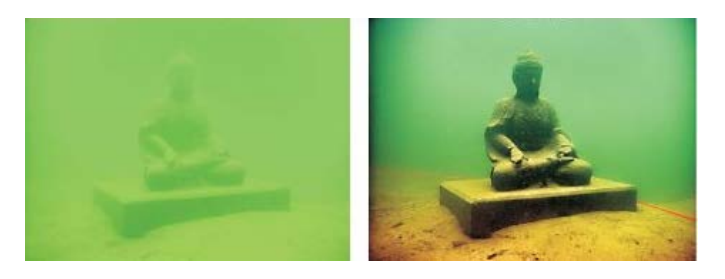
Fig. 1.1 An sample underwater image enhancement

Here, we introduce a novel approach that is able to enhance underwater images based on single image to overcome above mentioned problems. With respect to light reflection, Church [21] describes that the reflection of the light varies greatly depending on the structure of the sea. Another main concern is related to the water that bends the light either to make crinkle patterns or to diffuse it as shown in Figure 1. Most importantly, the quality of the water controls and influences the filtering properties of the water such as sprinkle of the dust in water [27]. According to Anthoni [22] the reflected amount of light is partly polarised horizontally and partly enters the water vertically. An important characteristic of the vertical polarisation is that it makes the object less shining and therefore helps to capture deep colours which may not be possible to capture otherwise.